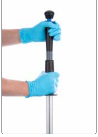
push up on the tulip trigger to start the flow of solution